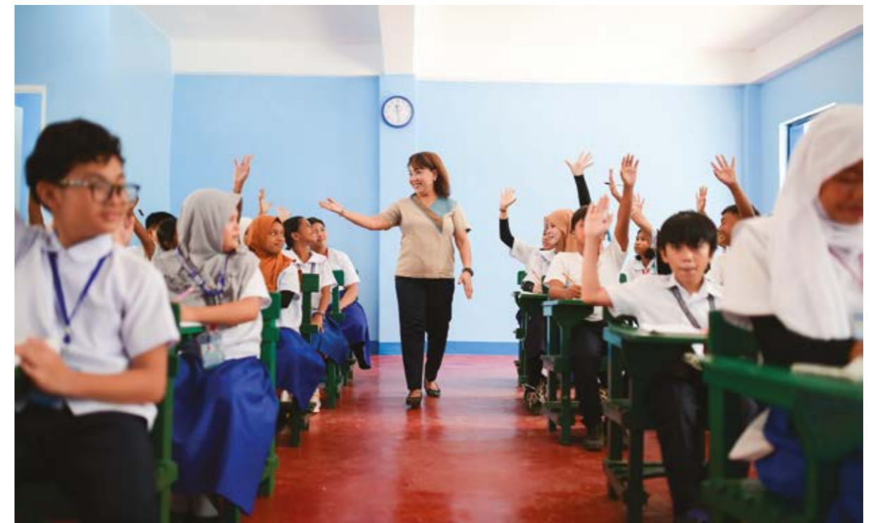
The SM Group, through SM Prime and SM Foundation, turned over a newly built two-story school building to Sta. Barbara Central Elementary School in Zamboanga City. This aims to uplift the community after suffering heavily during the 2013 Zamboanga siege.