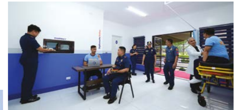
The new Camp Bado Dangwa Hospital enhanced its capabilities with a new pathological laboratory and expanded services, including dental care, emergency services, and mental health support.