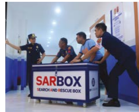
SM Foundation adds a Search and Rescue (SAR), allowing advanced SAR operations.