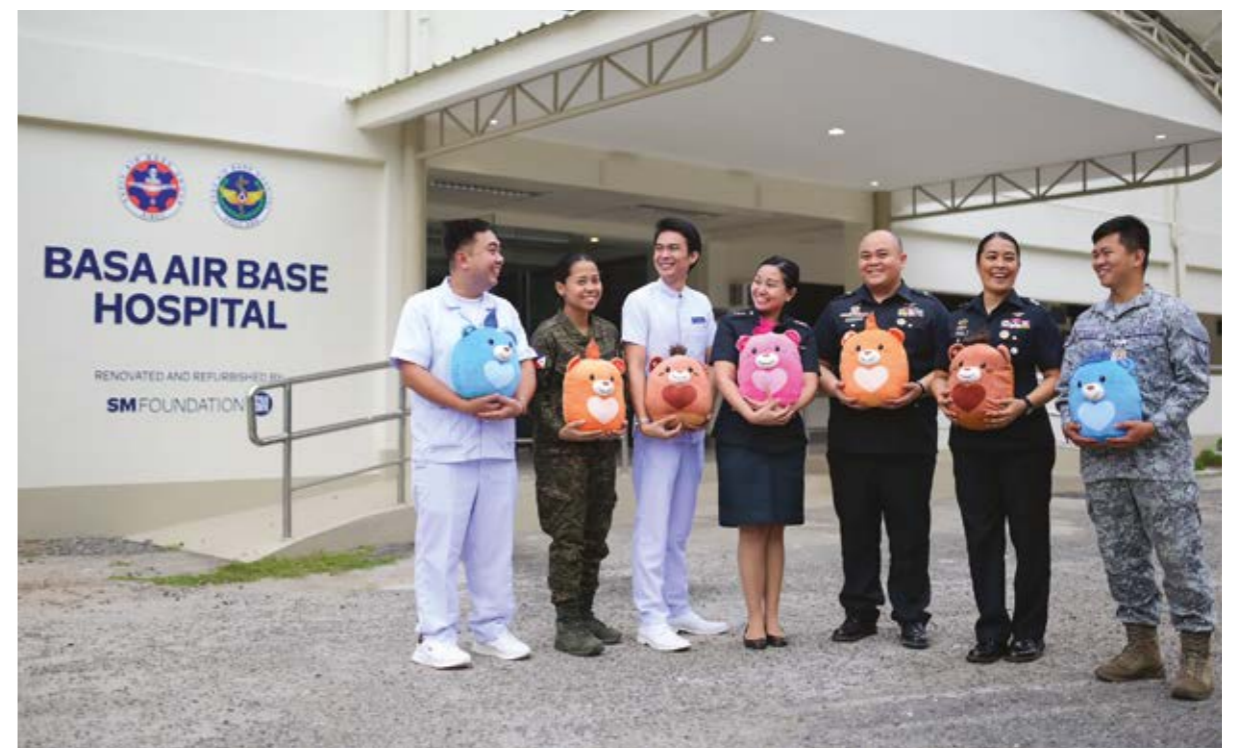
The new Basa Air Base Hospital in Floridablanca, Pampanga, renovated by the SM Foundation

Room, Reception Area, and Outpatient Department while implementing sustainable features like LED lighting and energy-efficient appliances. The hospital now offers comprehensive services, including general medicine, surgery, internal medicine, and laboratory work.