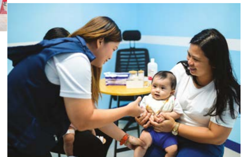
The renovation aims to improve child healthcare in both local health facilities.