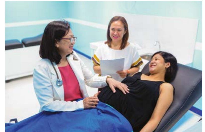
The new community health facility of Ormoc features dedicated spaces for prenatal and postnatal care

The San Pablo District Health Center in Ormoc also serves as a strategic satellite office, providing healthcare access to distant barangays.