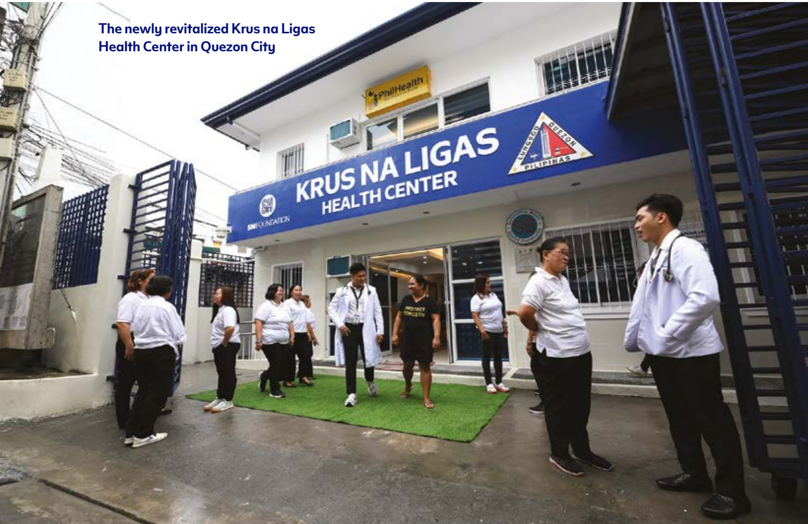
The newly revitalized Krus na Ligas Health Center in Quezon City