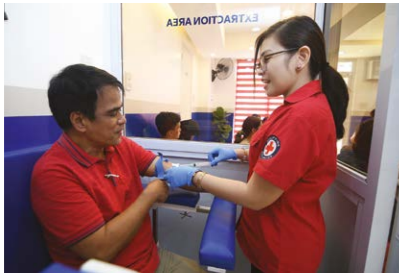
The newly refurbished Laboratory of the Philippine Red Cross Quezon City Chapter comes with a dedicated Extraction Room for the safety and comfort of patients and health workers.

The improved environment also benefits the almost two dozen health workers assigned at the facility, which in turn is expected to further improve services to the community.