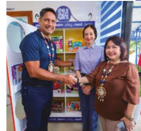
Leaders of SM Foundation, Ormoc City, and Leyte as they tour around the new facility.