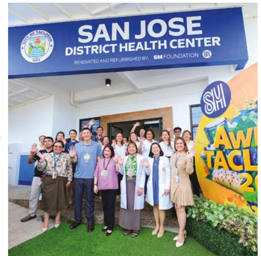
Members of SM Foundation and Tacloban local government unit during the turnover of the San Jose District Health Center.