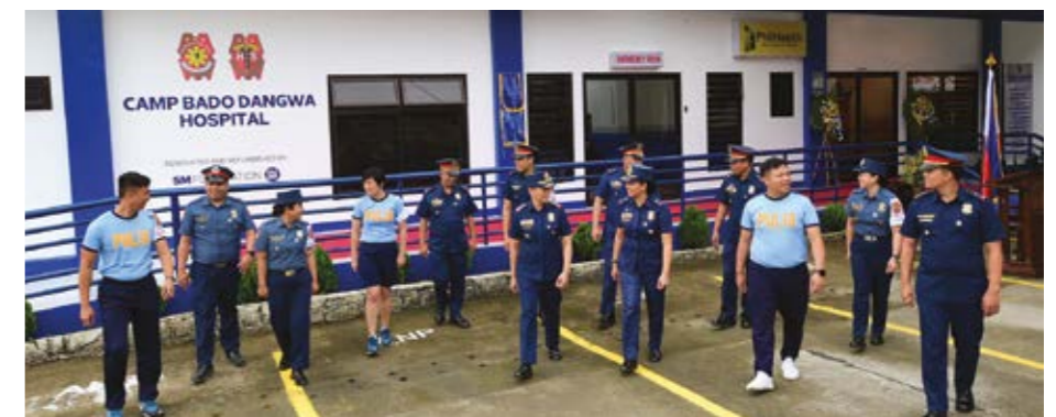
The newly refurbished Camp Bado Dangwa Hospital in La Trinidad, Benguet.