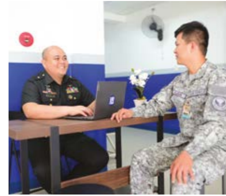
Basa Air Base Hospital is the first military hospital to adopt the SM DigiKonsulta.