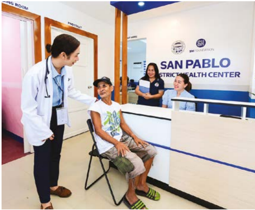
San Pablo District Health Center health workers in Ormoc attend to a patient.