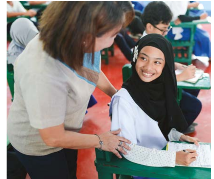
The school serves nearly 3,000 students—99 percent of whom are Muslim learners from four nearby barangays.

Now, more than a decade later, SM Foundation’s new four-classroom building signals a fresh start. The structure comes equipped with modern amenities including electric fans, toilets, washbasins, and specialized facilities like a clinic, mini library, and an arts and music room. The classrooms are furnished with inclusive features, including left-handed armchairs made by the PWD community in Manila.