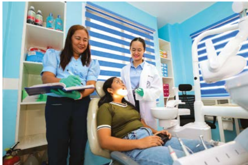
The San Jose District Health Center now has a designated area for dental health services, which was made possible by the refurbishment efforts of the SM Foundation.