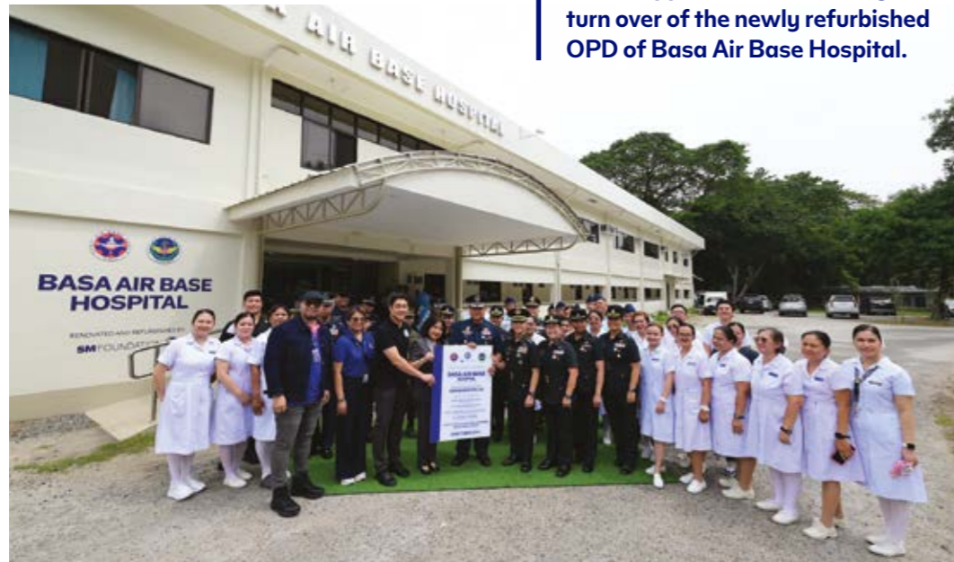
Representatives the SM Group and the Philippine Air Force during the turn over of the newly refurbished OPD of Basa Air Base Hospital.