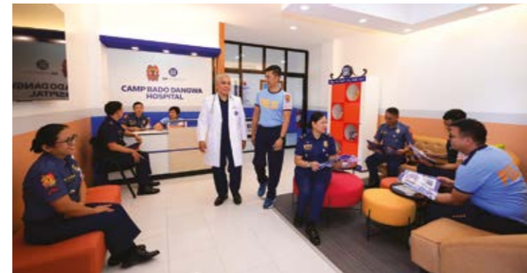
With the renovation, the Camp Bado Dangwa Hospital, is empowered to improve its services to over 10,600 PNP personnel and their dependents across six provinces and Baguio City.