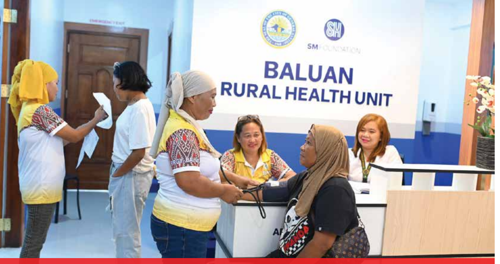
SM Foundation recently turned over its 205th health center, bringing quality community healthcare closer to Filipinos from vulnerable communities in GenSan.