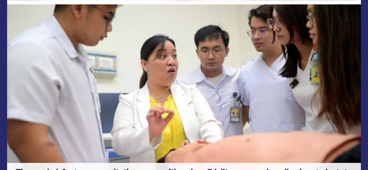
The new hub features consultation rooms with various fidelity mannequins, allowing students to develop empathy, adaptability, and resilience, critical skills for their future roles in medicine.