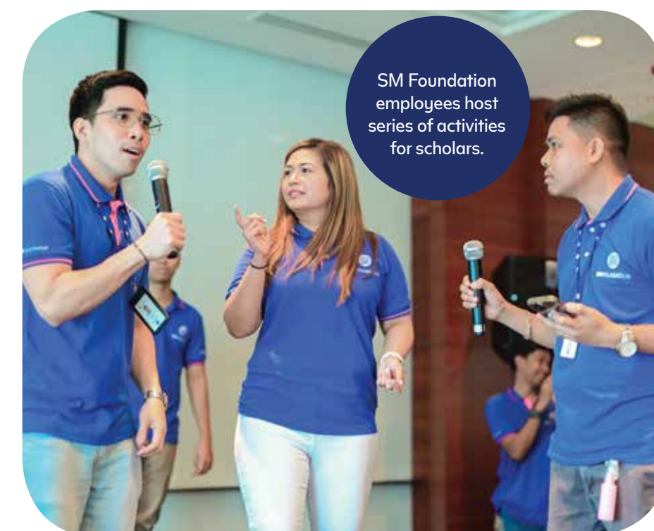
SM Foundation employees host series of activities for scholars.

compassion and leadership, molding future leaders and nation-builders committed to giving back and uplifting others.