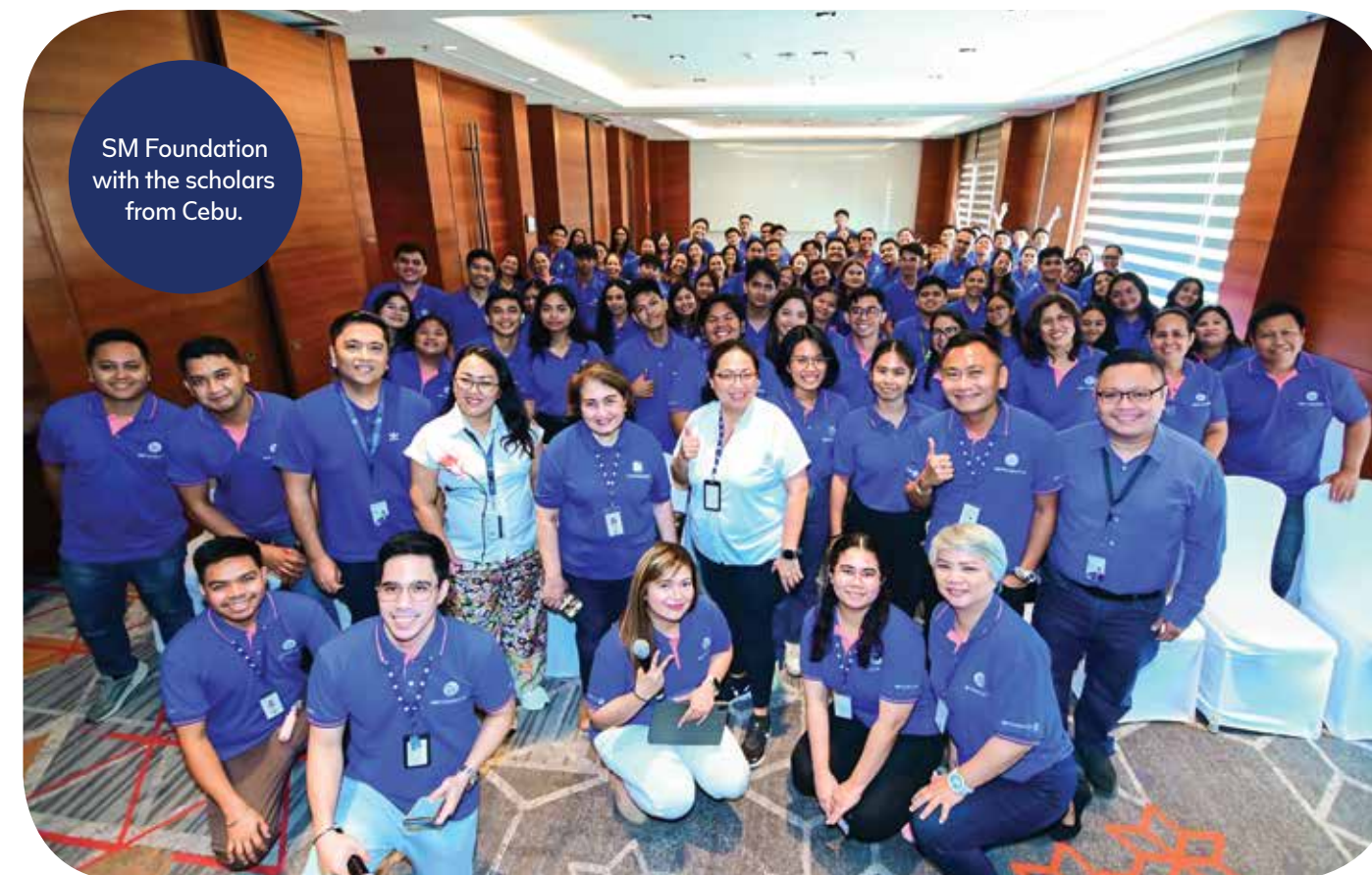
SM Foundation with the scholars from Cebu.

opening doors to opportunities they might never have had, we see that it's not just about financial support; it's about changing lives and creating brighter futures.