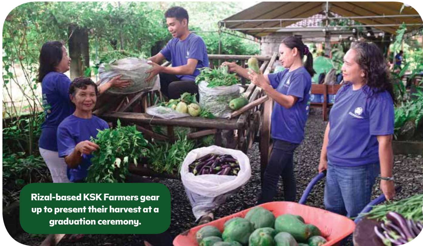
Rizal-based KSK Farmers gear up to present their harvest at a graduation ceremony.

In collaboration with key partners such as DSWD, DA, DTI, TESDA, DOST, DOLE, SM Markets, SM Supermalls, and