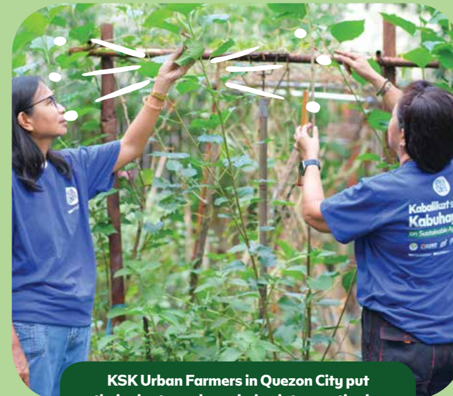
KSK Urban Farmers in Quezon City put their plant care knowledge into practice by conducting a visual inspection of their crops

communities. Moving beyond traditional philanthropy, it empowers Filipino farmers nationwide with modern agricultural practices, encompassing meticulous land preparation to efficient post-harvesting methods. Through a comprehensive 14-week technical training, the program instills a culture of self-reliance and sustainable livelihoods, equipping participants with invaluable agripreneurship skills and facilitating access to essential resources.