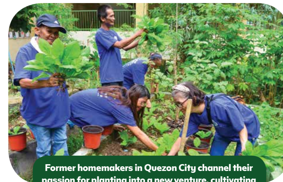
Former homemakers in Quezon City channel their passion for planting into a new venture, cultivating vegetables in a local community garden.