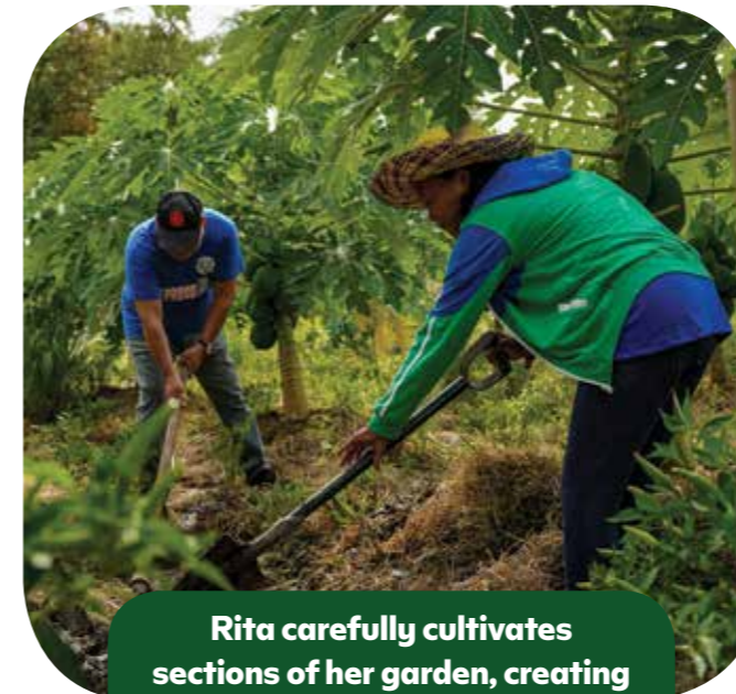
Rita carefully cultivates sections of her garden, creating more space for future crops.