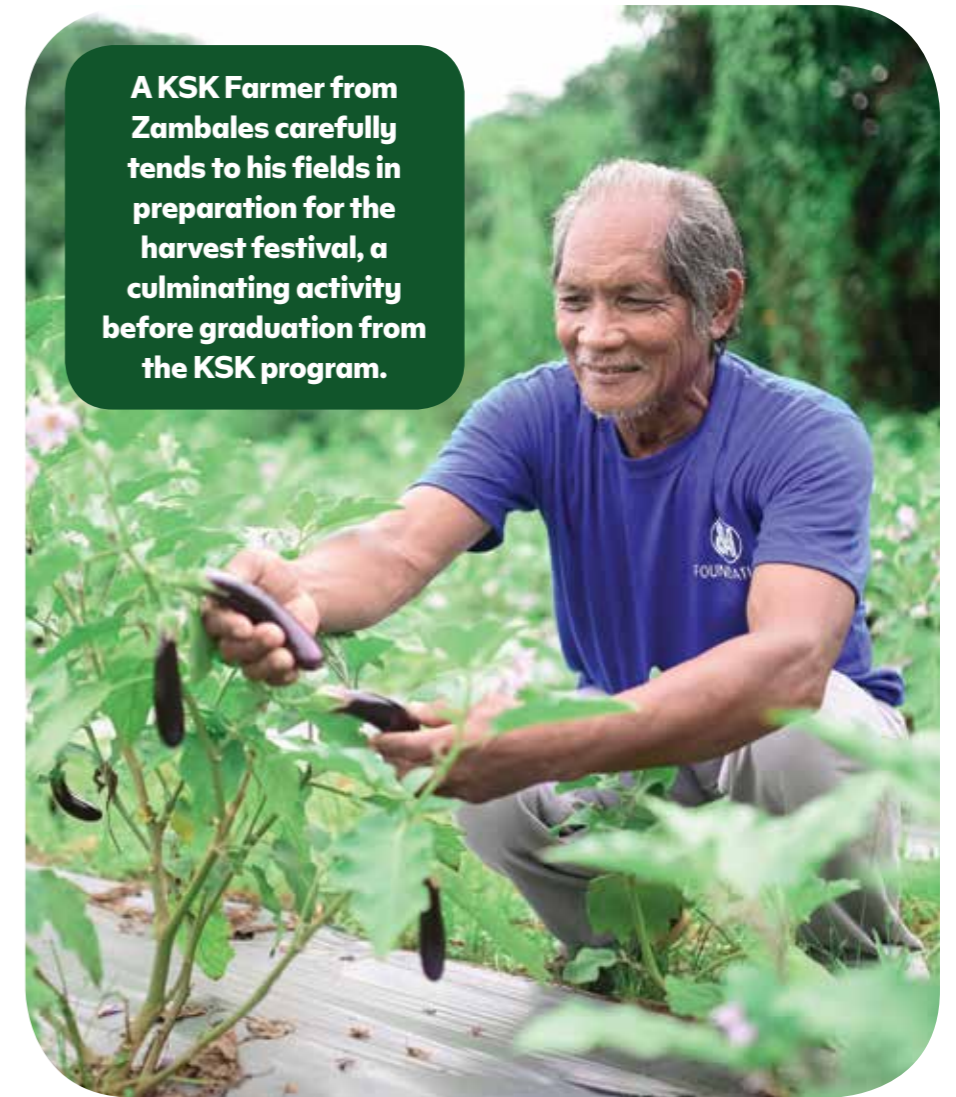
A KSK Farmer from Zambales carefully tends to his fields in preparation for the harvest festival, a culminating activity before graduation from the KSK program.