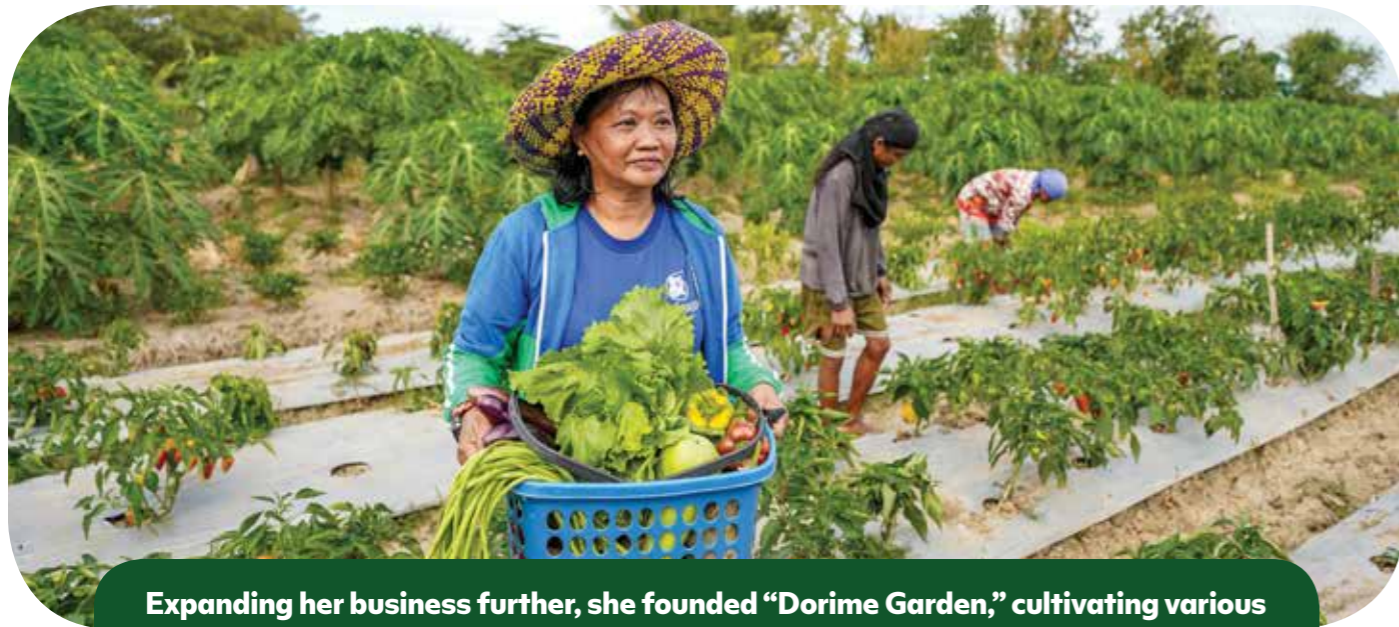
Expanding her business further, she founded “Dorime Garden,” cultivating various vegetables for sale, and creating a livelihood opportunity for a community member.

Seeking new opportunities, she completed KSK’s 14-week training: “Gusto ko pong magkaroon ng bagong oportunidad para matuto sa farming at lalo na sa marketing kaya nagkainteres po akong sumali sa programang KSK ng SM Foundation.”