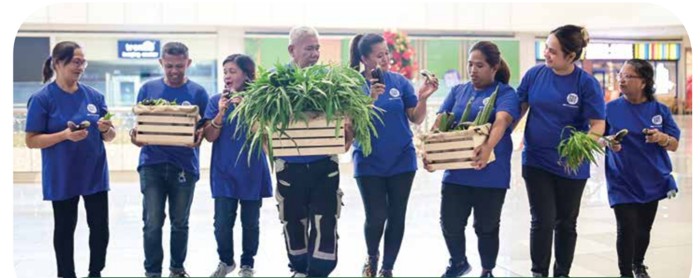
KSK Urban Farmers bring the plants they grew on SM City San Lazaro's rooftop to showcase during their graduation ceremony.