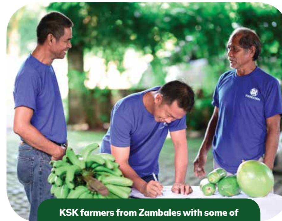
KSK farmers from Zambales with some of their produce