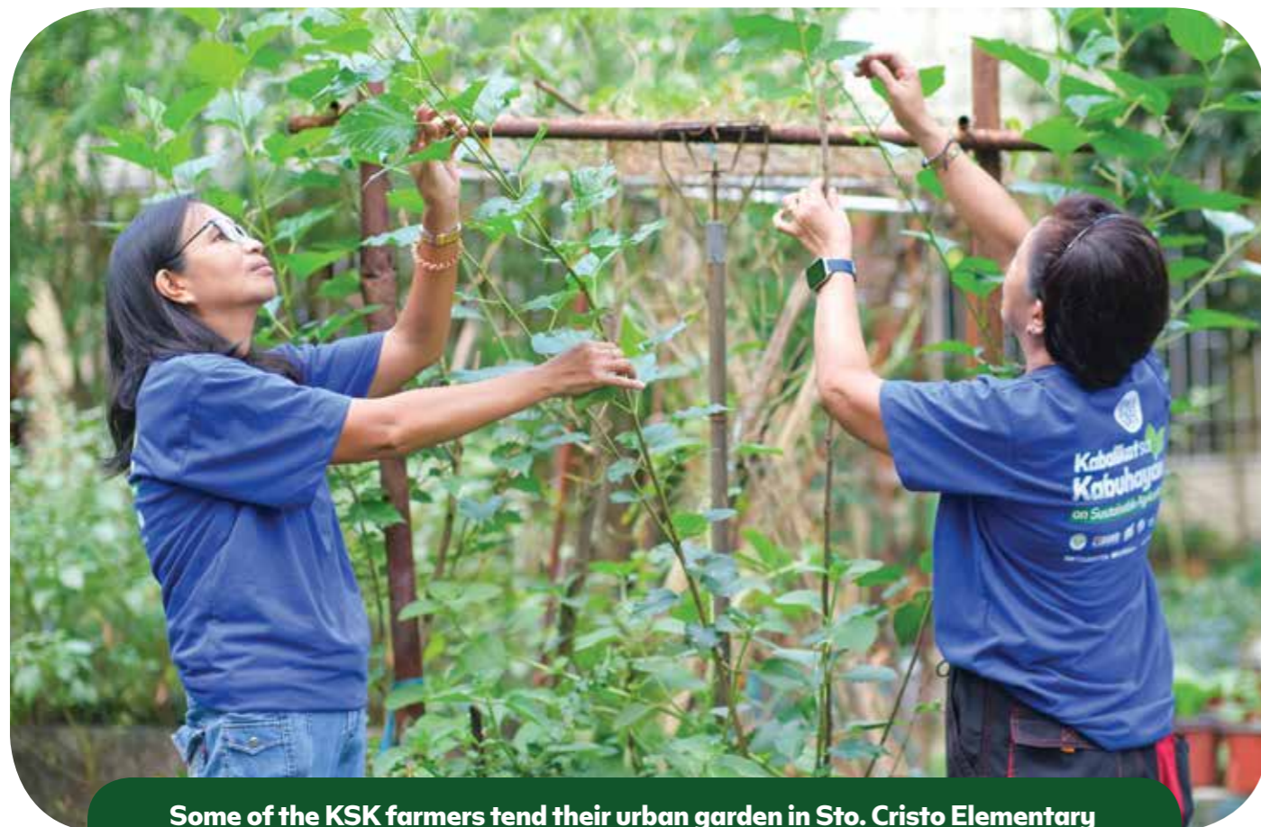
Some of the KSK farmers tend their urban garden in Sto. Cristo Elementary School, another urban garden cultivated by KSK beneficiaries.