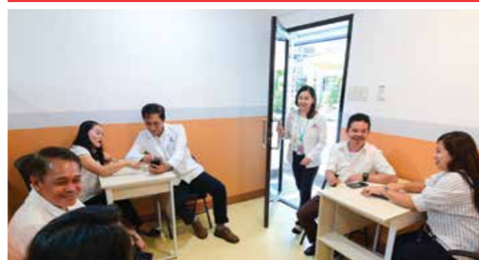
The clinic has ample tables and chairs to help accommodate patients simultaneously while maintaining comfort and privacy.