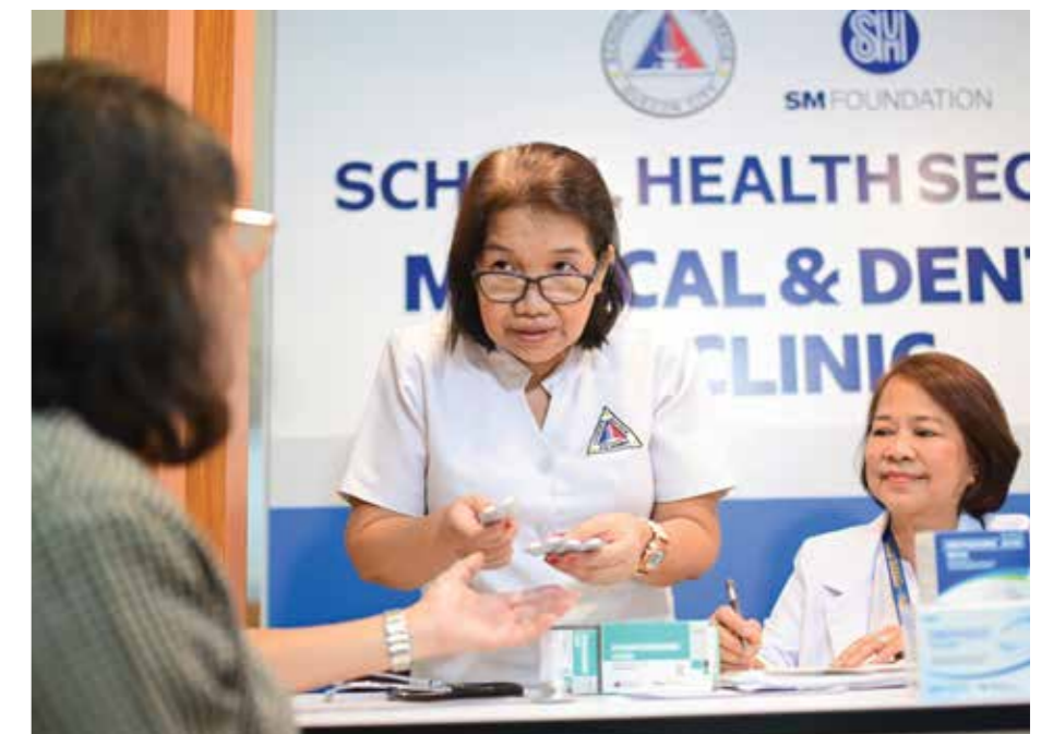
SM Foundation and DepEd equip the new medical and dental clinic with medicines and medical equipment to provide immediate care to teachers, staff, and students.