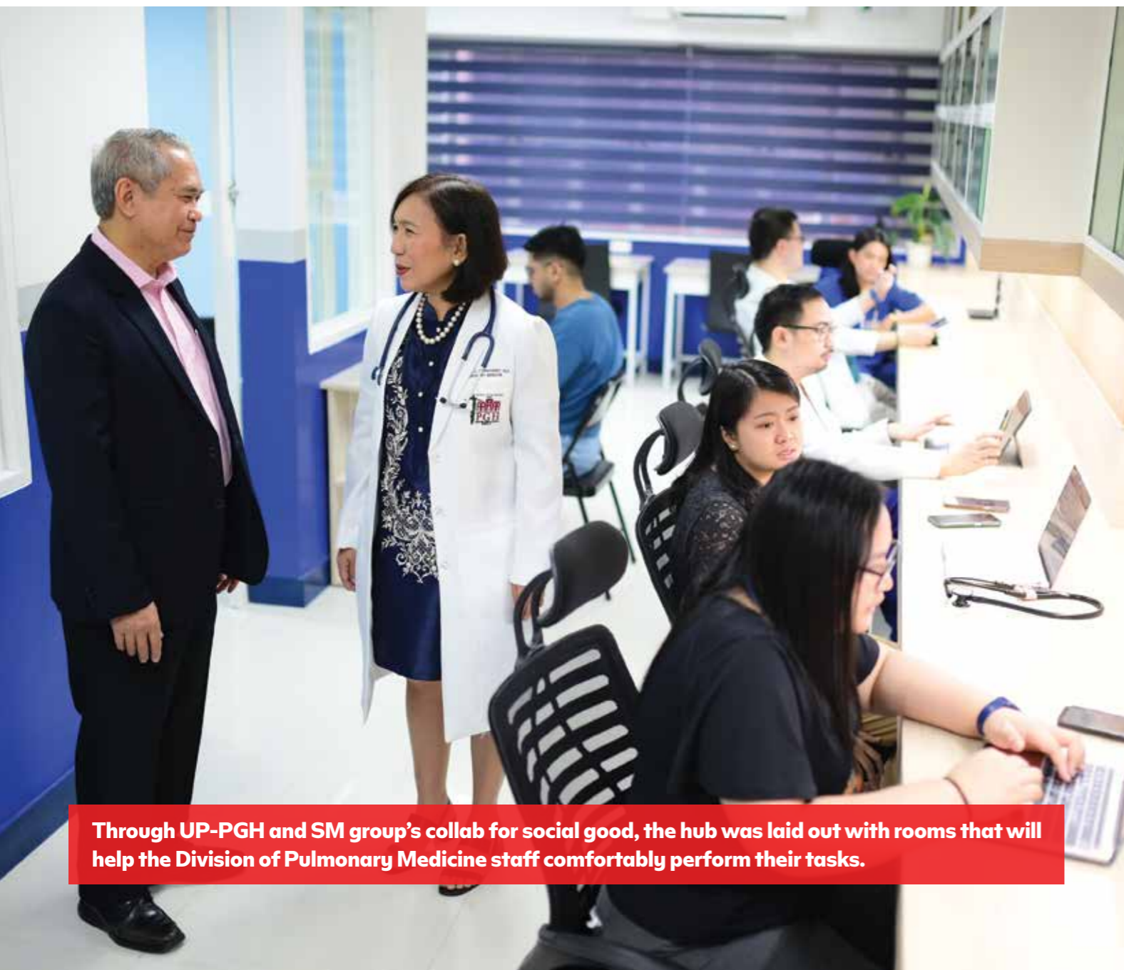
Through UP-PGH and SM group's collab for social good, the hub was laid out with rooms that will help the Division of Pulmonary Medicine staff comfortably perform their tasks.