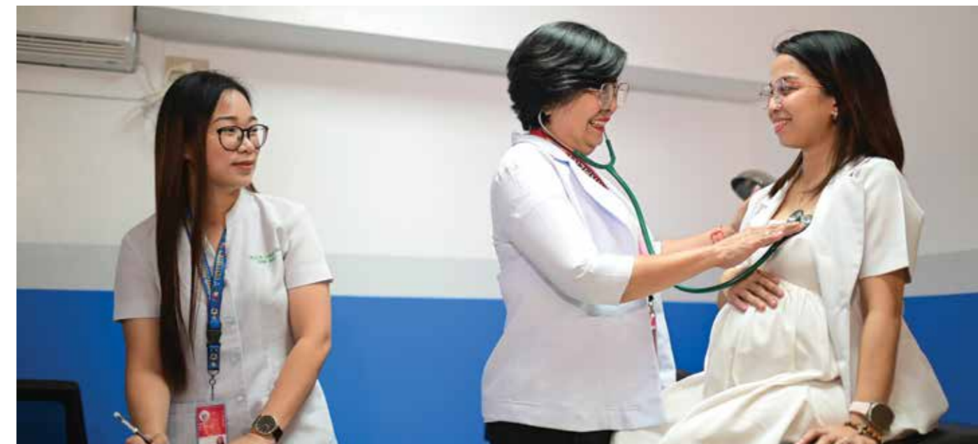
A DepEd employee undergoes free prenatal care in the newly refurbished medical and dental clinic at the Quezon City Schools Division Office (QC-SDO).

The clinic will also serve as a platform for preventive healthcare, promoting healthy lifestyles and encouraging regular check-ups.