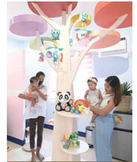
Breastfeeding room in Brgy. Irawan Birthing Facility, Puerto Princesa, Palawan