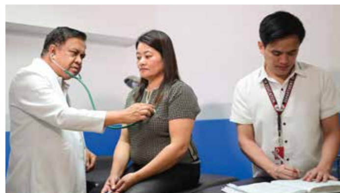
A staff of DepEd-QC receives free check-up inside the new clinic.