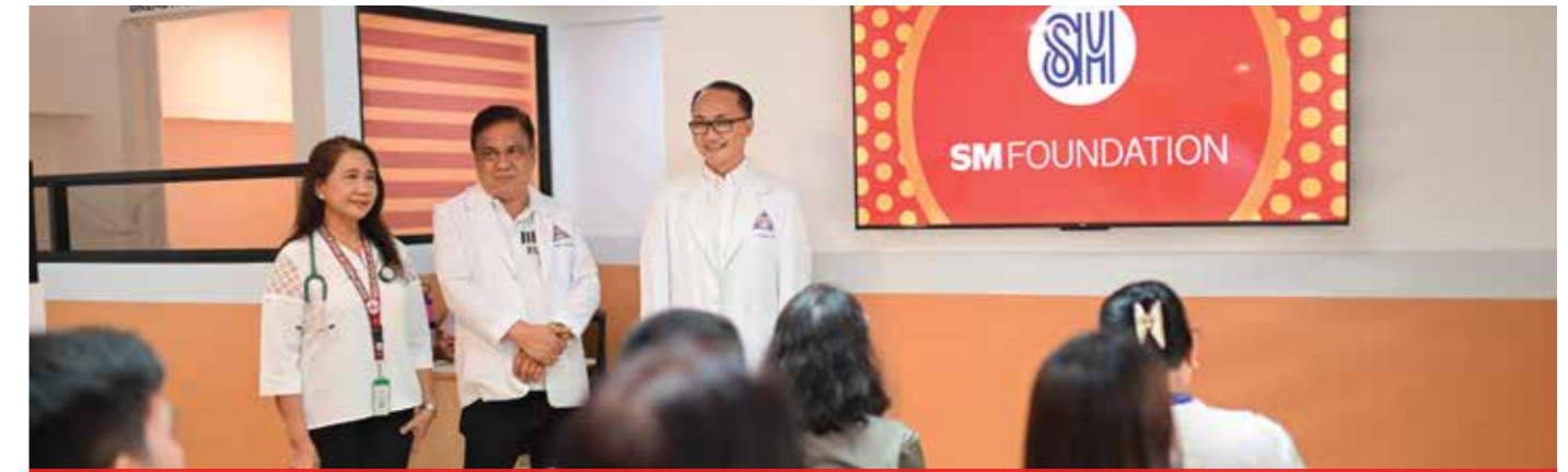
A well-designed floor plan optimizes healthcare workflows by providing dedicated spaces for planning and crucial meetings.