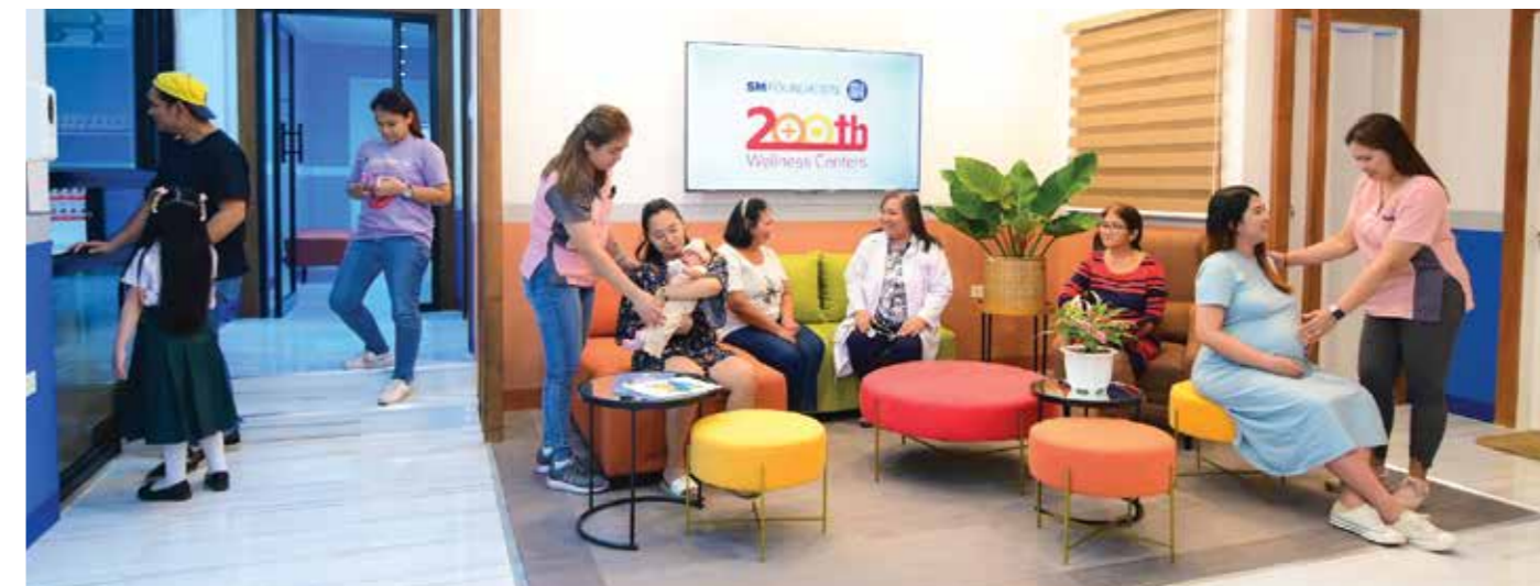
SCRHU features a vibrant lobby with new furniture and appliances.

Service amidst challenges SCRHU lies in Laguna province, serving nearly 140,000 residents. Its reach extends beyond the immediate community, welcoming those from neighboring municipalities, primarily from low-income households.