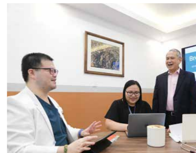
Inside one of the meeting rooms of the UP-PGH PulmoCare Hub.