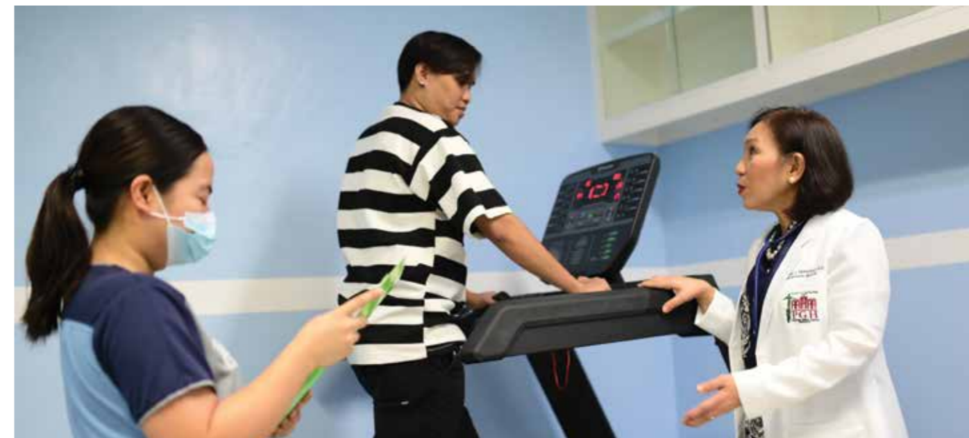
Through the rehabilitation, a spacious area has been dedicated to medical tests to fight the effect of 'long COVID.'