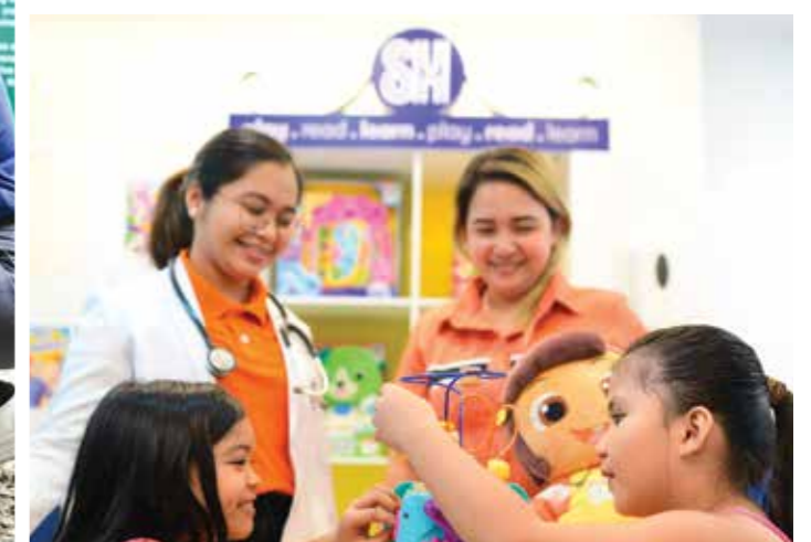
Inside the new Brgy. 118-120 Health Center in Caloocan City.