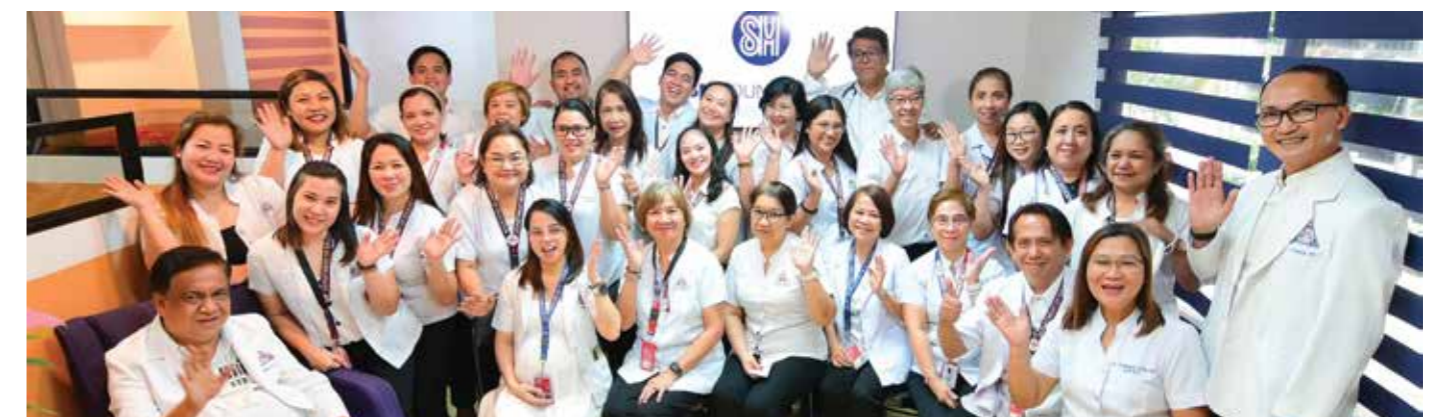
Team members of the DepEd-QC School Health Section Medical and Dental Services inside the new clinic.