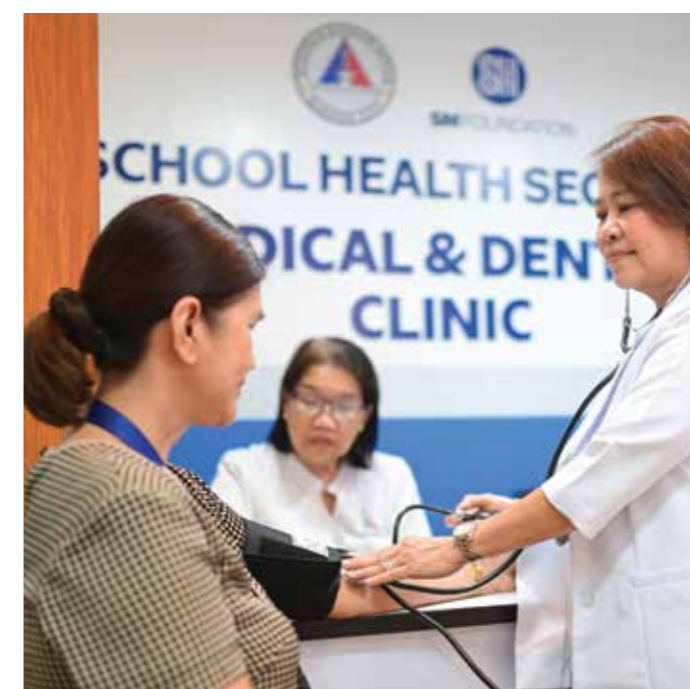
Teachers and teaching staff monitor their blood pressure inside the new clinic.

With the development, the DepEd NCR is hopeful that they will become better equipped to provide extensive medical services to promote the positive impact of health on academic performance.