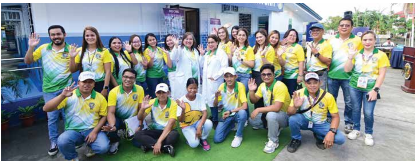
SCRHU health workers serve its community with renewed passion after the renovation of SM Foundation's 200th health center.

“Iba kasi pag maganda ang surroundings mo. Minsan, ‘yun lang ay sapat na para gumaan ang pakiramdam mo. Ngayong comfortable na ang center, mae-enhance na ang communication namin. Sa tulong ng organized at good environment, maipaliliwanag ng mabuti at magagawa kung ano ang nararapat na treatment para sa pasyente,” she added.