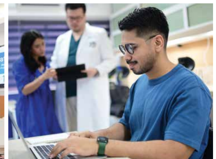
Work stations are strategically placed for virtual consultations.