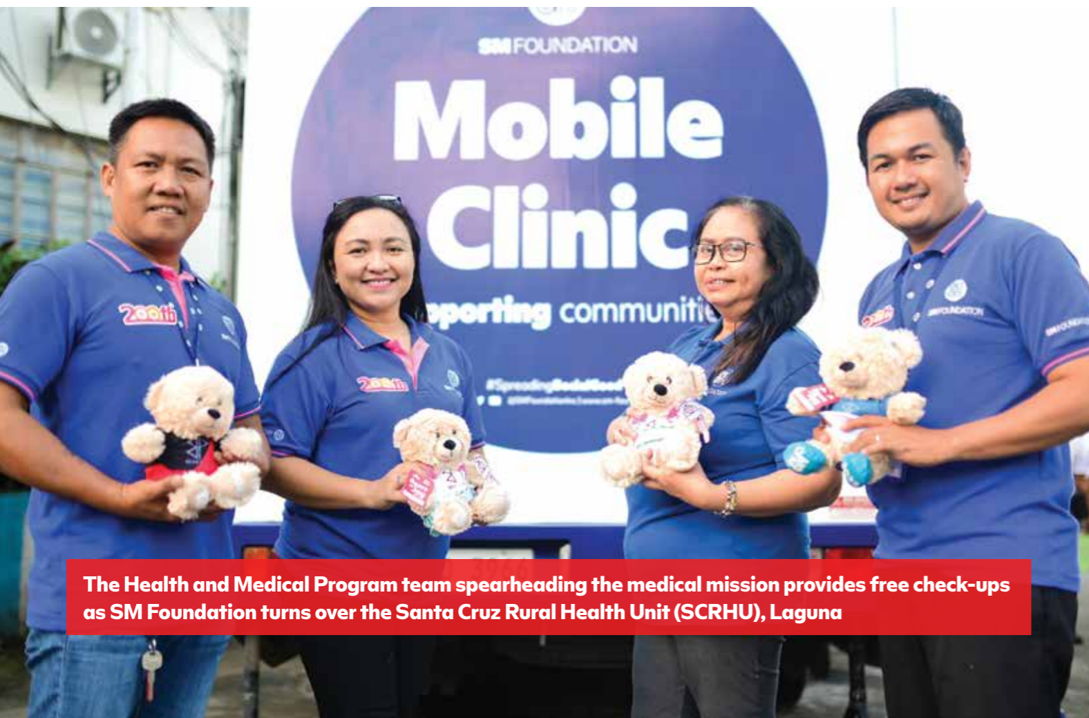
The Health and Medical Program team spearheading the medical mission provides free check-ups as SM Foundation turns over the Santa Cruz Rural Health Unit (SCRHU), Laguna