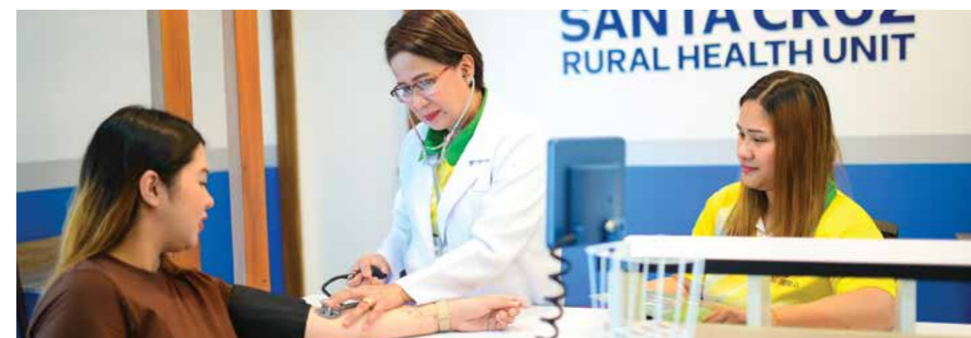
Following the rehabilitation, SCRHU health workers are more eager to serve the community.

Uplifting community anchors Following Department of Health’s guidelines, SM Foundation elevated the SCRHU. The center now boasts clearly defined areas for different programs, improved layout for accessibility, and enhanced facilities for patient comfort. A rainwater catchment facility was introduced to contribute to water conservation.