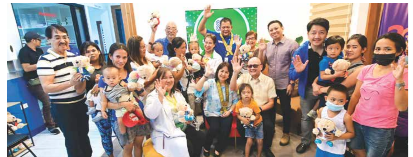
The Health and Medical Program team spearheading the medical mission provides free check-ups as SM Foundation turns over the Santa Cruz Rural Health Unit (SCRHU), Laguna