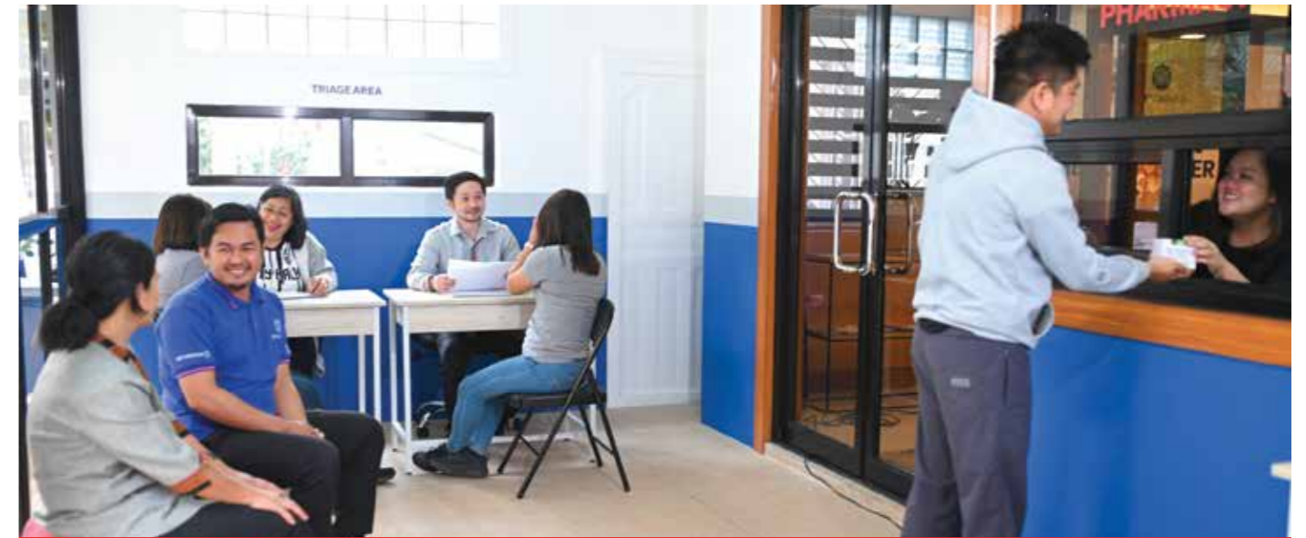
Samson assists a patient inside the newly refurbished waiting area of LHC

At SM Foundation, we are dedicated to fostering tangible connections within communities. Through strategic partnerships with like-minded organizations, ranging from