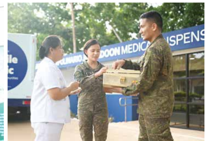
The new Apolonio Jalandoon Medical Dispensary