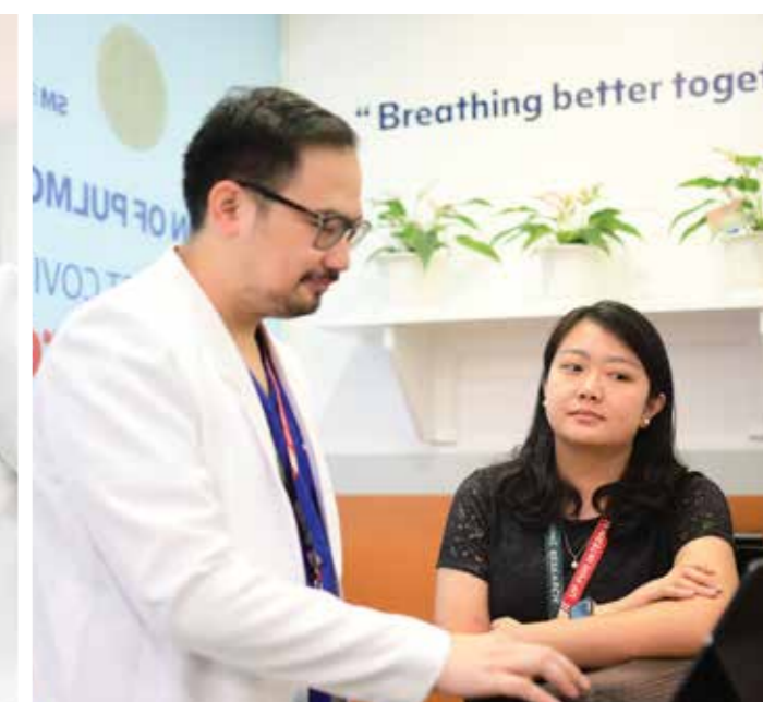
Doctors and staff at UP-PGH use renovated areas for patient consultations.