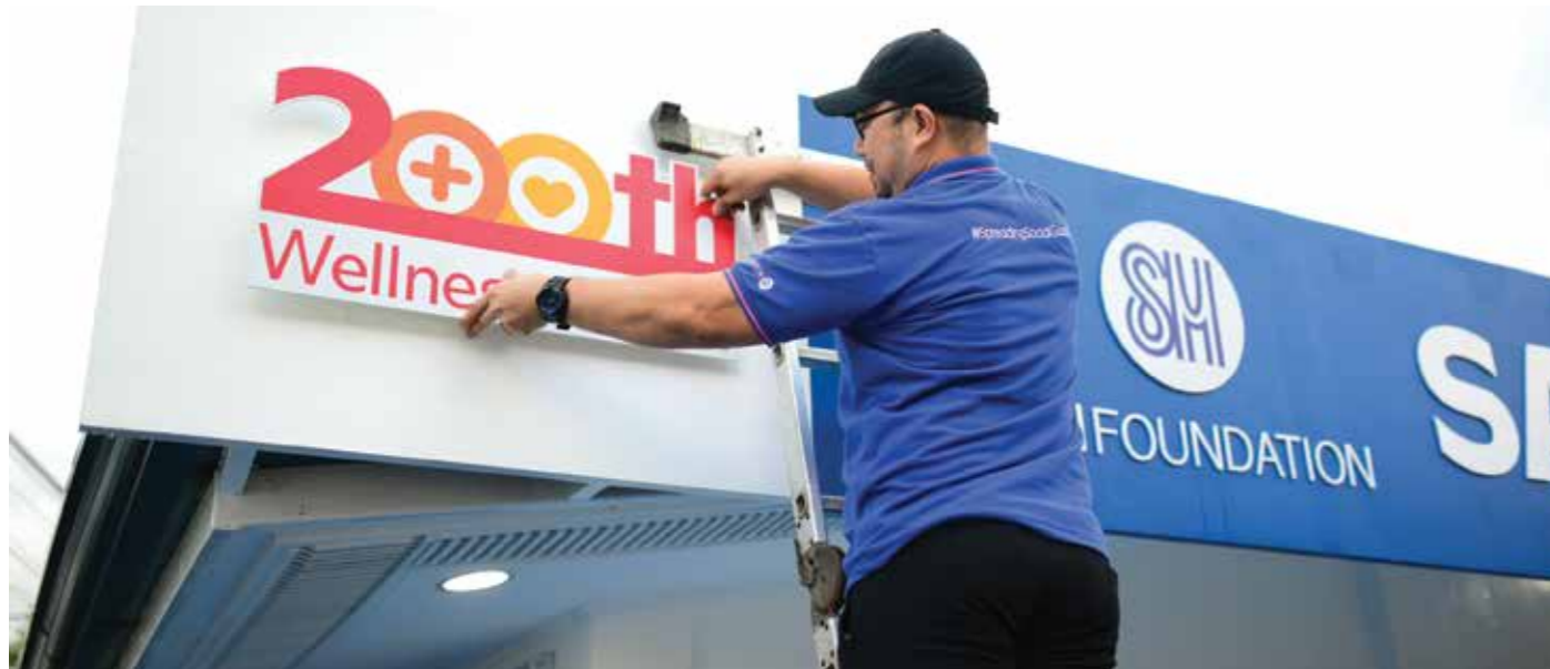
The author in action as he places the 200th health center marker in SCRHU

local NGOs and national government agencies to SM group employee-volunteers and community members, we have been able to achieve remarkable milestones. This collaborative approach has been instrumental in establishing our 200th Health Center*, a significant achievement for the SM group. Moreover, it has paved the way for the successful execution of various projects over the years, including our recent initiatives at: