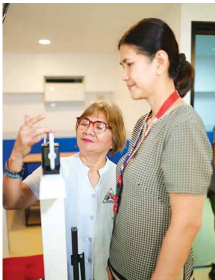
SM Foundation equips the clinic with medical facilities, allowing them to boost their service to the community.