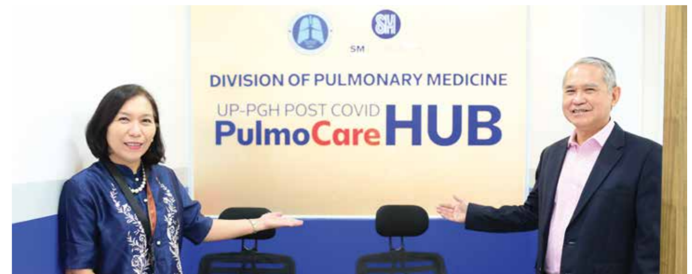
Heads of UP-PGH PulmoCare Hub proudly show the newly renovated hub.