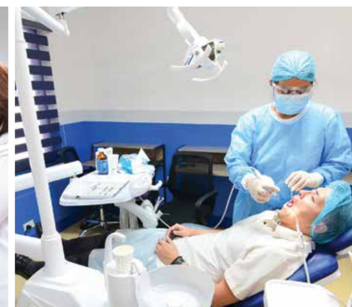
A dentist performs a tooth extraction inside the newly renovated medical and dental clinic at the Quezon City Schools Division Office (QC-SDO).