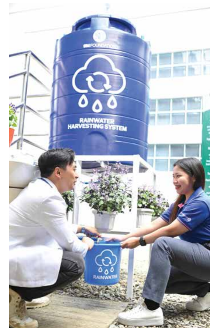
The Rainwater Harvesting System installed by SM Foundation